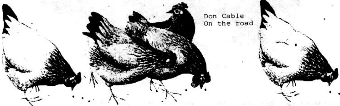
Don Cable On the road

Producing and maintaining a quality flock of exhibition birds over a period of time is essentially the result of a series of the correct decisions. Your best decision was to keep poultry to begin with and besides, in what other hobby can you eat your mistakes?